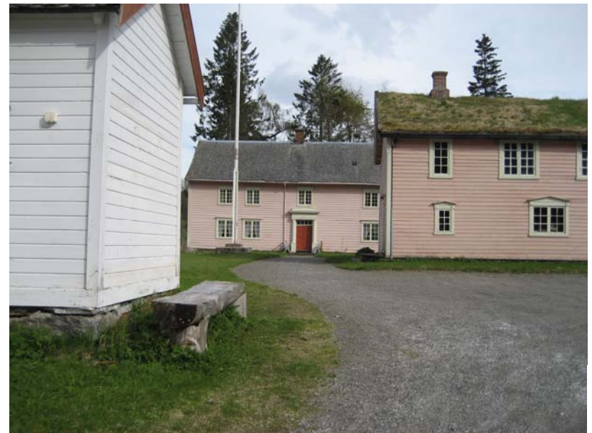
Røsvik Hovedgård (main building)

Contact: Telephone +44 75695148 / +44 90788134 / Per Reffhaug E-mail (preferred): per.reffhaug@sorfoldnett.no